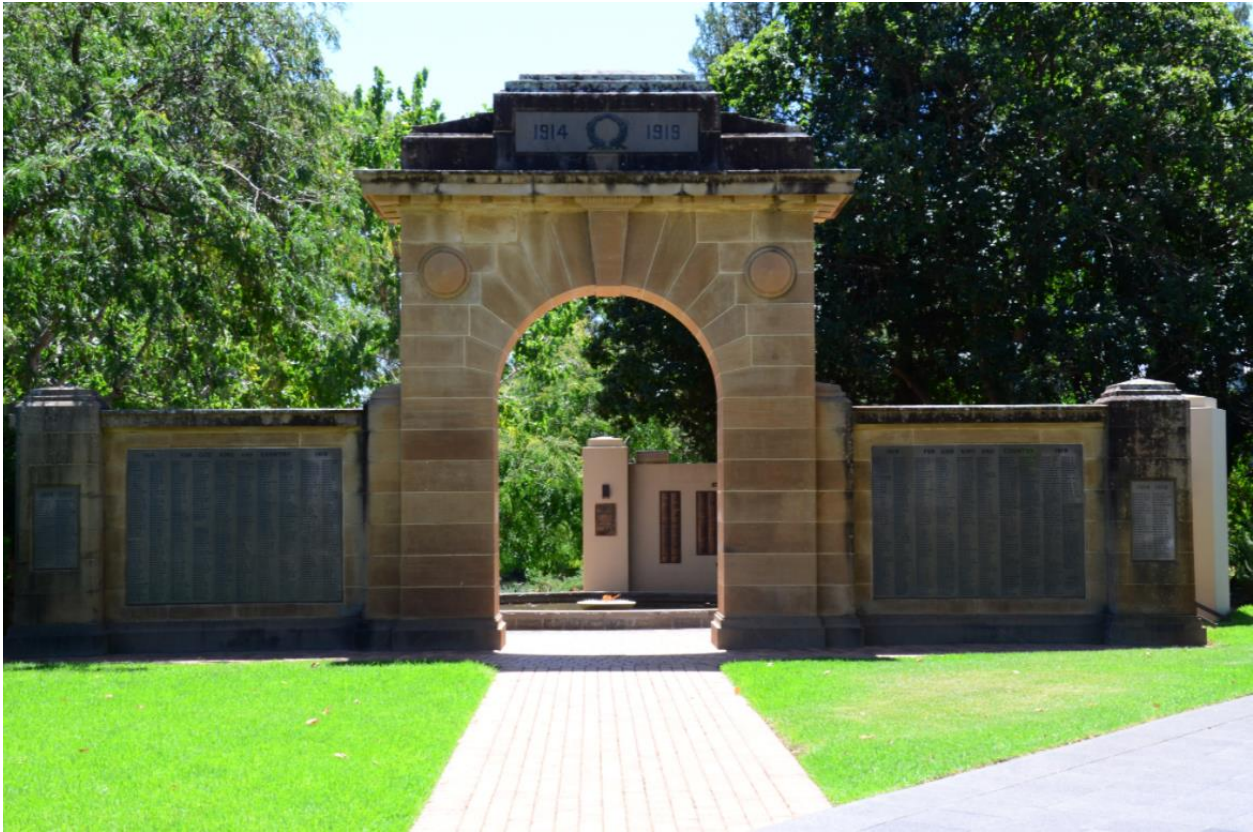
Wagga Wagga War Victory Memorial Arch