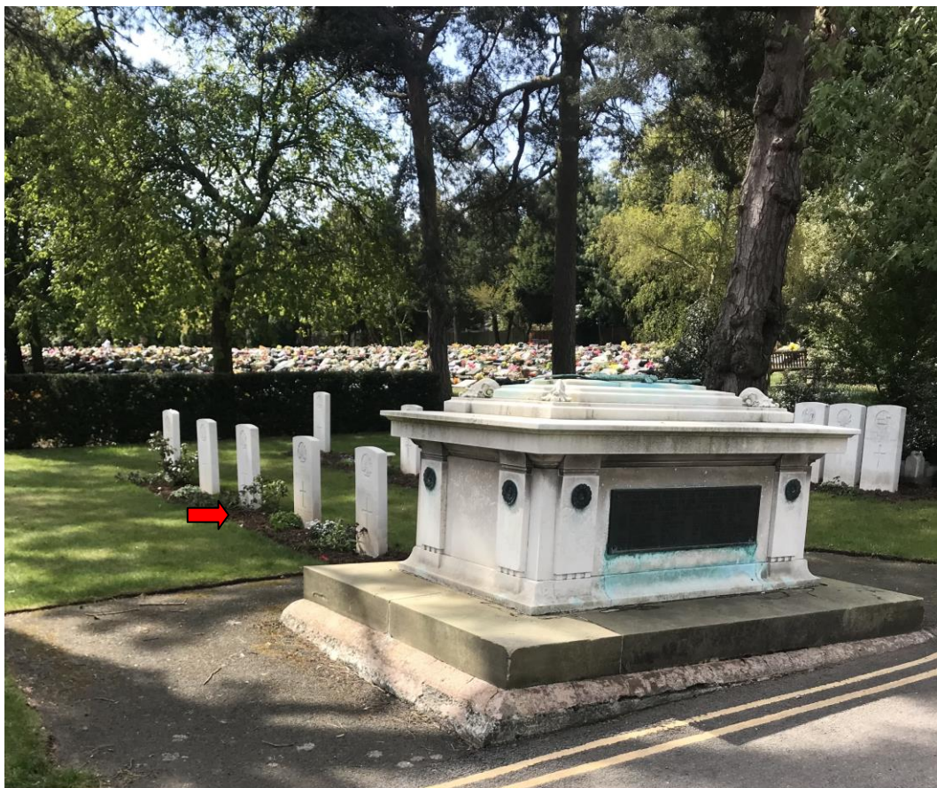
Arrow showing the Plot where Australian WW1 War Graves are located