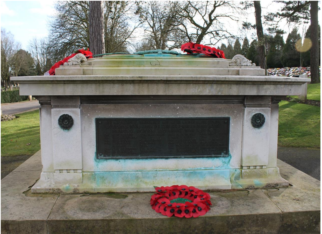
Stourbridge Cemetery Overseas Soldiers Sarcophagus/Memorial