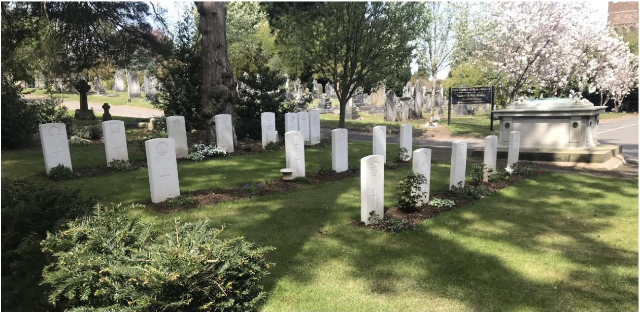
Australian Plot