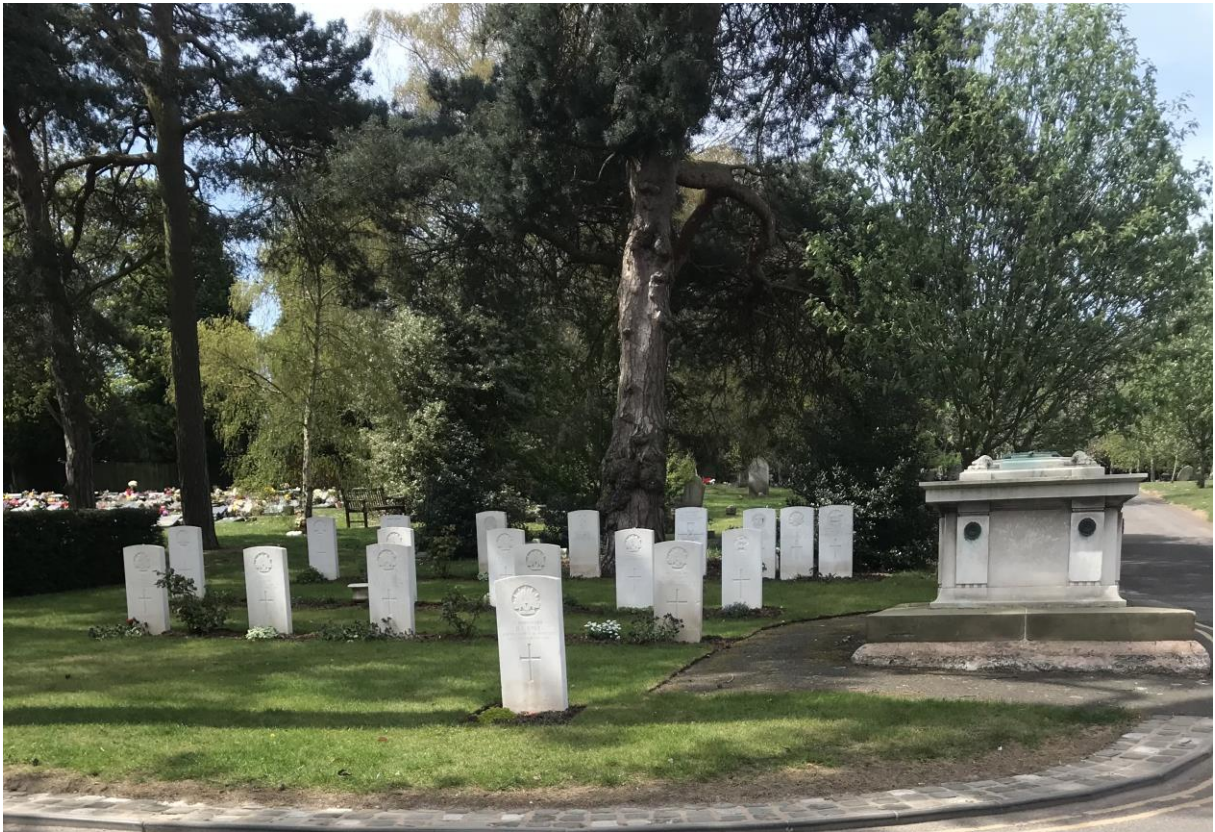
Stourbridge Cemetery showing Australian WW1 War Graves